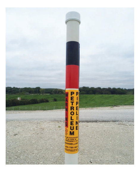
Our pipeline markers can be typically identified by the black and red bands at the top.

Magellan Midstream Partners, L.P., a wholly owned subsidiary of ONEOK, Inc., is principally engaged in the transportation, storage and distribution of refined products and crude oil. Magellan operates a 9,800 mile refined products pipeline system with 54 connected terminals as well as 25 independent terminals not connected to our pipeline system, two marine terminals (one of which is owned through joint venture) and a 2,200 mile crude oil pipeline system.